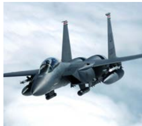
F-15E Strike Eagle