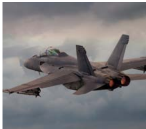
F/A-18 Hornet & Super Hornet

EXPANSION Boeing ( St. Louis ) announced plans to bring up to 2,000 new jobs to Missouri in 2013 and 2014. In 2014, Boeing revealed that a new production line for the 777x would be added in St. Louis and announced plans to bring an additional 500 jobs to St. Louis for service and support of the F-22 Raptor aircraft. In 2013, Boeing announced the creation of an information technology center in St. Louis, resulting in at least 400 new IT jobs, and also announced plans to add an additional 400 research and technology jobs. The company's Defense, Space & Security unit, which is headquartered in St. Louis with approximately 15,000 area employees, makes military aircraft, missiles, airborne lasers, and Unmanned Combat Air Vehicles (UCAVs). F/A-18 Super Hornets and F-15 E Strike Eagles, mainstays of the Navy and Air Force, are designed and built in St. Louis. The unit is also NASA's prime contractor for the International Space Station and makes information and communications satellite systems. Boeing recently opened a new research laboratory in St. Charles to test hardware and software for drones and unmanned vehicles.