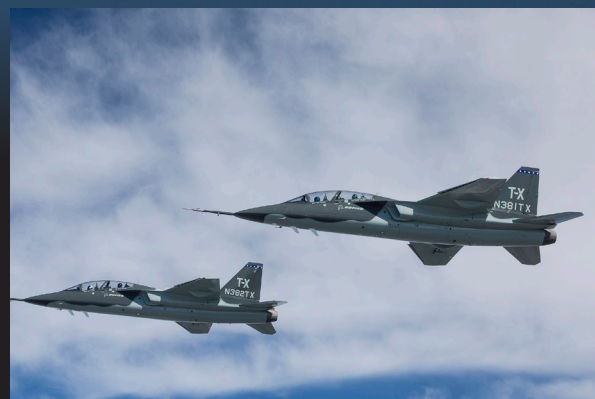
T-7 RED HAWK