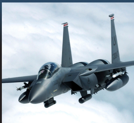
F-15E STRIKE EAGLE