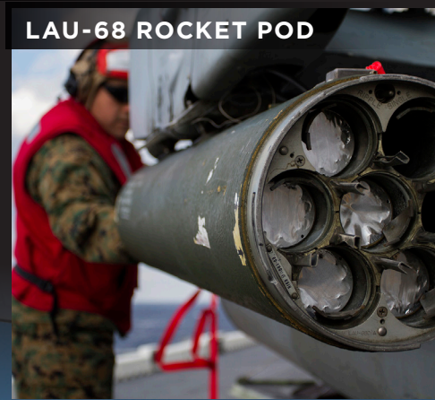
LAU-68 ROCKET POD

THRIVING INDUSTRY: Missouri is home to more than 100 companies leading the aerospace and defense industry, including: